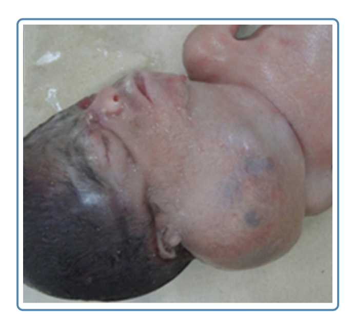
Figure 2 Auto

Autopsy of the fetus showing the neck mass.