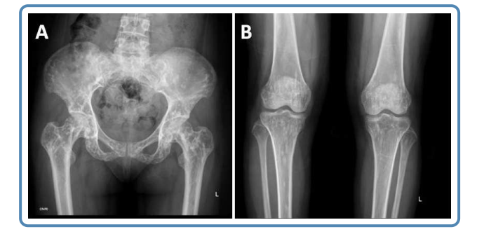
Figure 2 Radiographs of proband's mother shows – (A) Multiple sclerotic foci in pelvis, epiphyseal and metaphyseal regions of femur, (B) Knee joint with small discrete sclerotic lesions involving the epiphyseal and metaphyseal regions of femur and tibia.

Figure 1 (A) Radiograph of the shoulder joint demonstrating multiple sclerotic foci involving the scapula, epiphysis and metaphysis of humerus in the proband, (B) Knee joint with small discrete sclerotic lesions involving the epiphyseal and metaphyseal regions of femur and tibia, (C) Hyperostotic lesions in pelvis, epiphyseal and metaphyseal regions of femur.