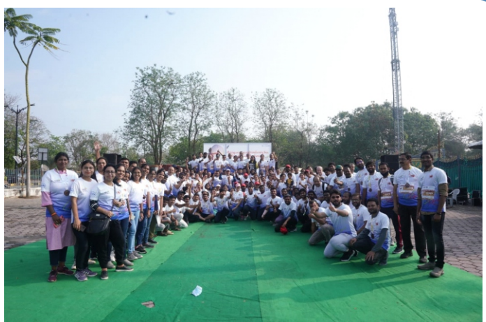
Race for 7 held on 19th March 2023 in Hyderabad; organized by the Organization for Rare Diseases India (ORDI).