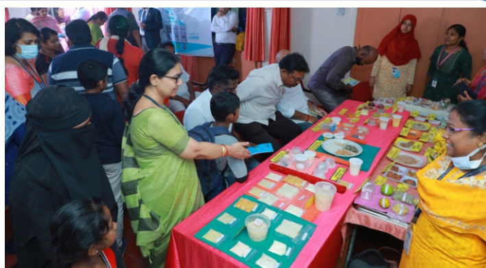
Rare Disease Day-related CME on 'Recent Advances in the Management of Alkaptonuria and Wilson's Disease' was held on 10th March 2023 at Christian Medical College (CMC), Vellore; organized by the Department of Clinical Genetics, CMC, Vellore.