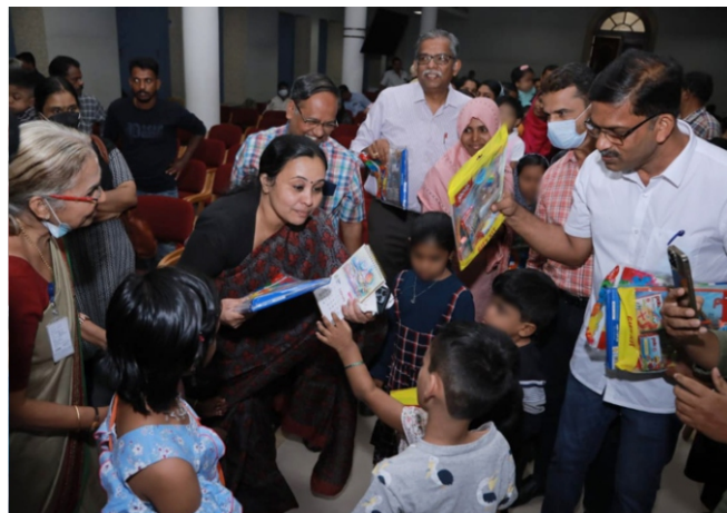
Rare Disease Day event held on 28th February 2023 at Government Medical College, Thiruvananthapuram (GMCT); organized by the Genetic Division, Department of Pediatrics, SAT hospital, GMCT in association with LSDSS and the Cure SMA foundation.